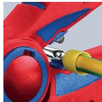
Fast, easy crimping