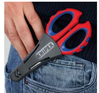
Safely stored and ready to hand at all times